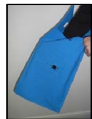
Contents are removed and bag is ready to re-use.