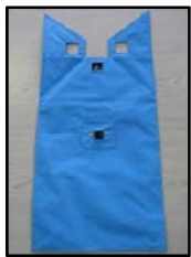
Items are placed into Purge Bag.