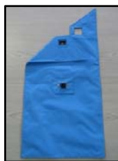
One flap is folded down.