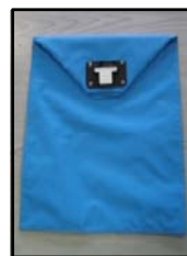
Top flap is folded down and seal "clicked" in.