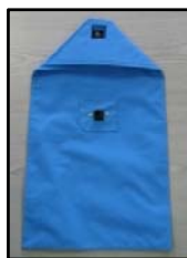
Other flap is also folded down.